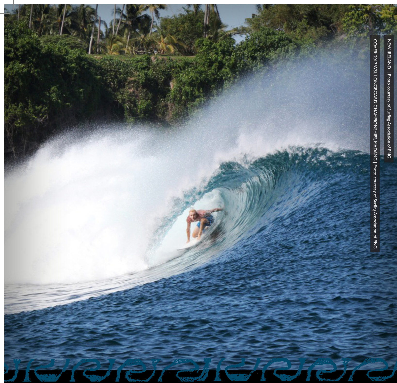
COVER 2017 WSL LONGBOARD CHAMPIONSHIPS, MADANG | Photo courtesy of Surfing Association of PNG