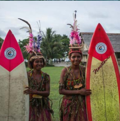
PINK NOSE SURF BOARDS MADANG