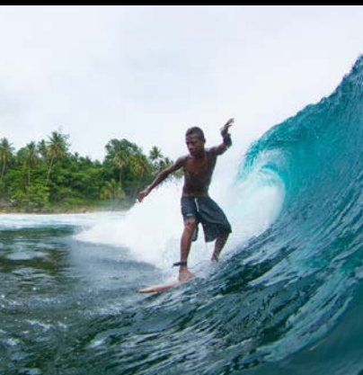
VANIMO SANDAUN | Vanimo Surf Lodge