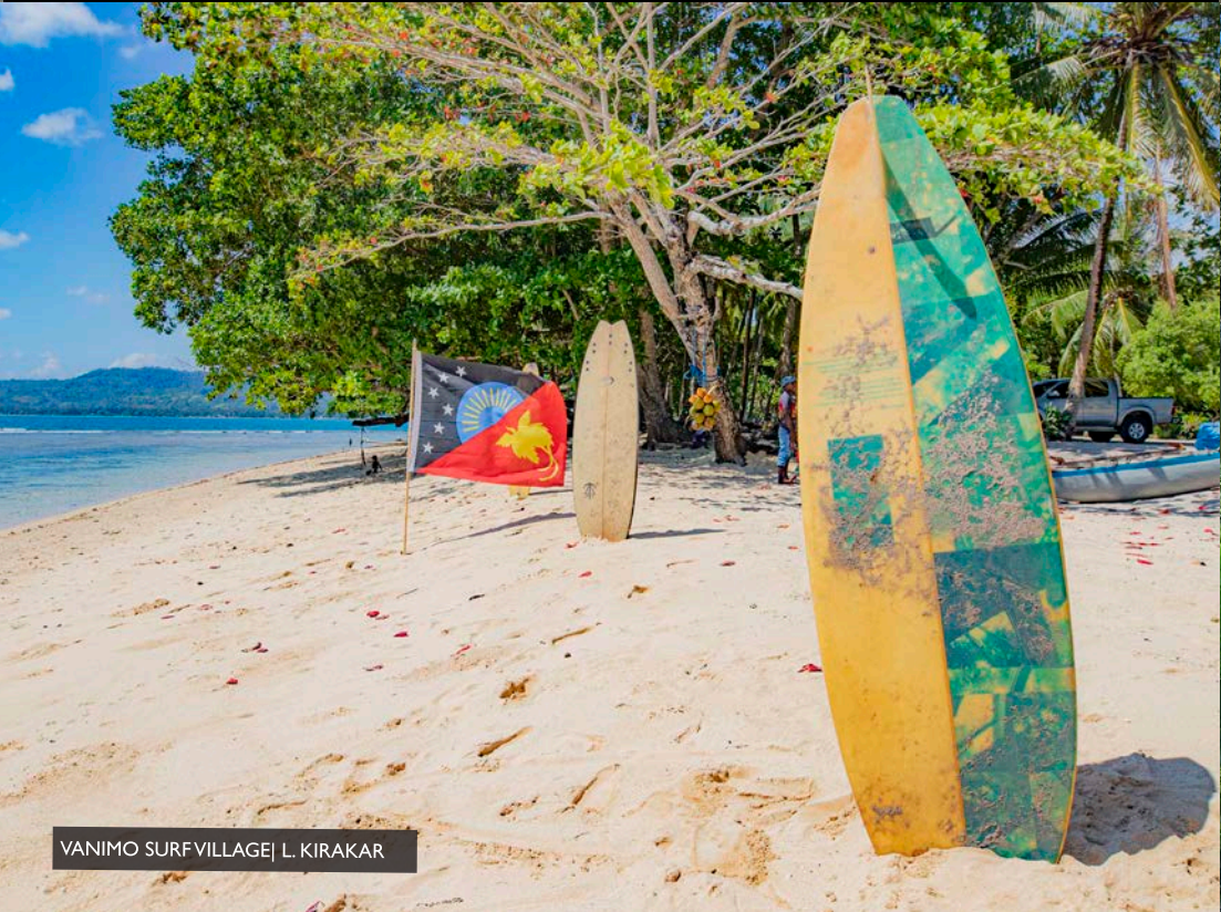
VANIMO SURF VILLAGE