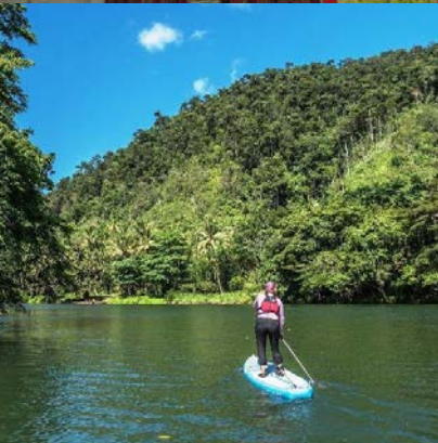
SUP MILNE BAY | PNG Trekking Adventures