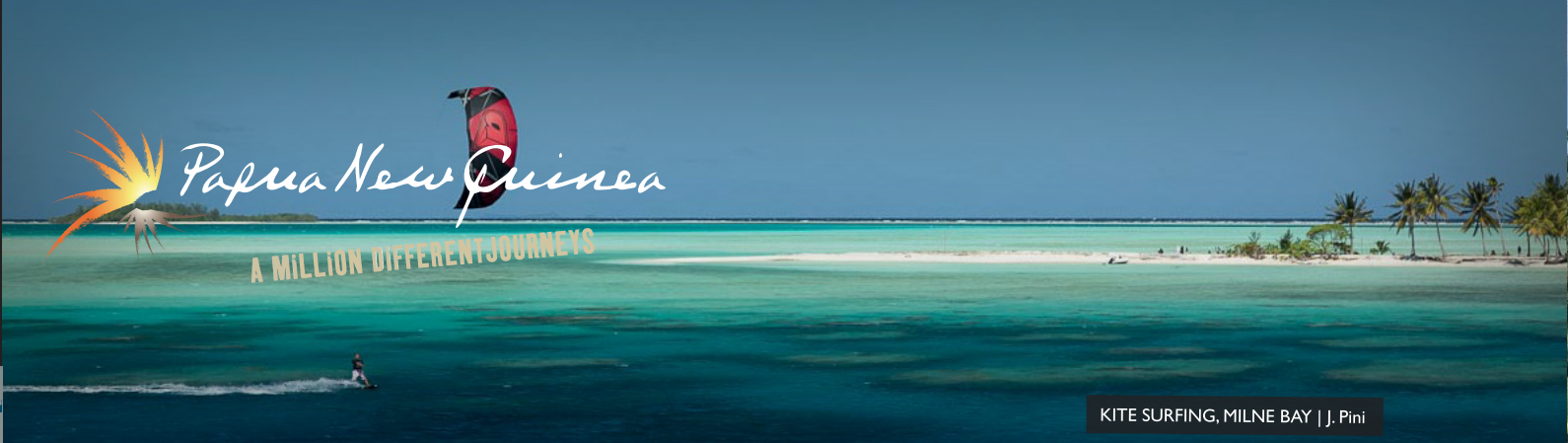
KITE SURFING, MILNE BAY | J. Pini

NEW IRELAND | Photo courtesy of Surfing Association of PNG