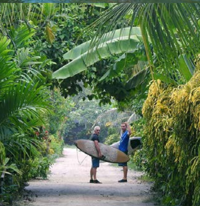
VANIMO SANDAUN | No Limit Adventures