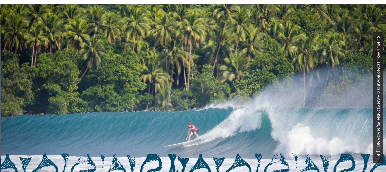
KUMULWSL LONGBOARD CHAMPIONSHIPS, MADANG