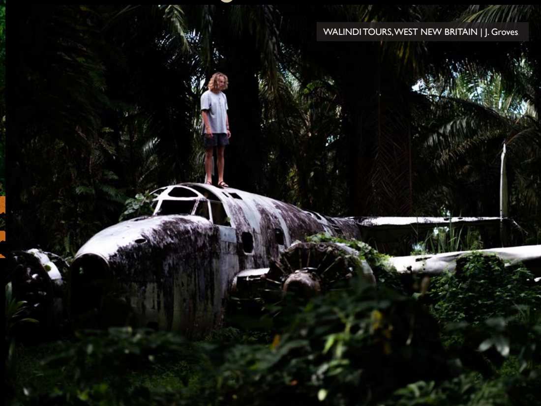
WALINDI TOURS, WEST NEW BRITAIN | J. Groves