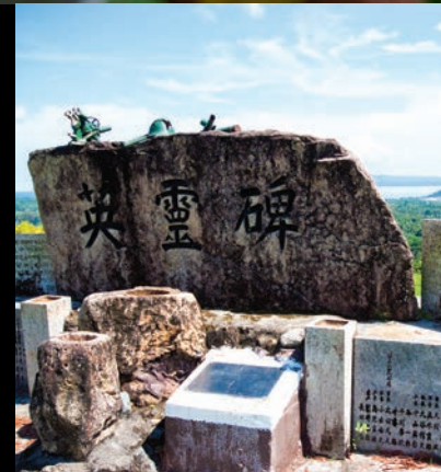
MISSION HILL, EAST SERIK | D. Kirkland