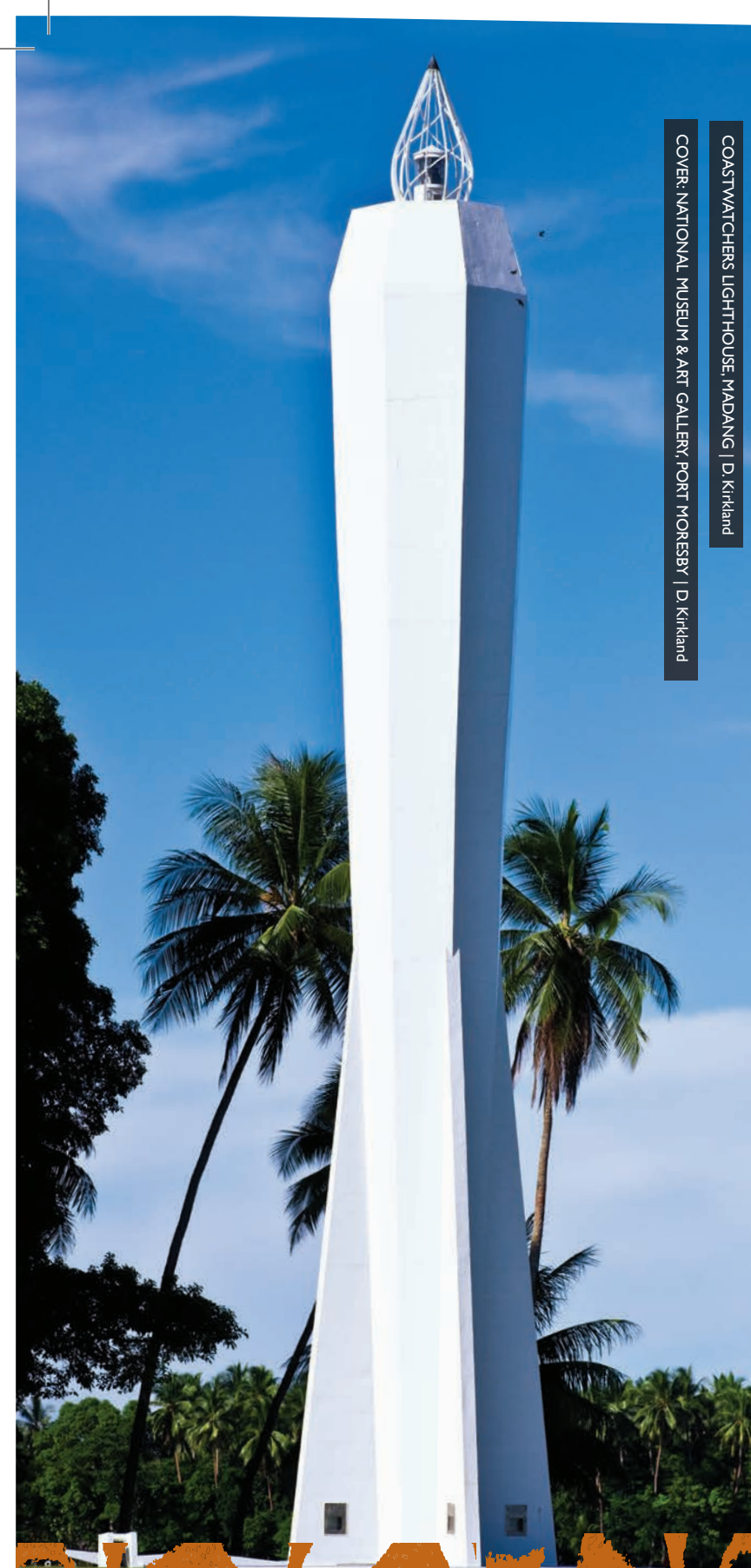
COASTWATCHERS LIGHTHOUSE, MADANG | D. Kirkland COVER: NATIONAL MUSEUM & ART GALLERY, PORT MORESBY | D. Kirkland