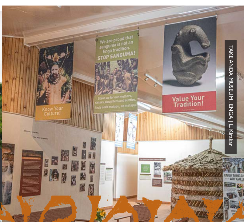
TAKE ANDA MUSEUM, ENGA