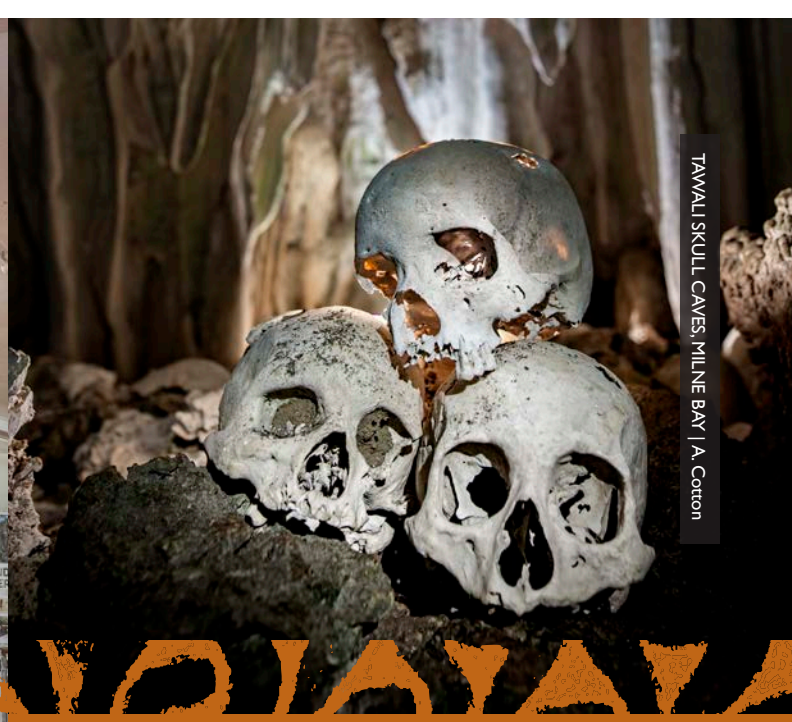
TAWALI SKULL CAVES, MILNE BAY | A. Cotton