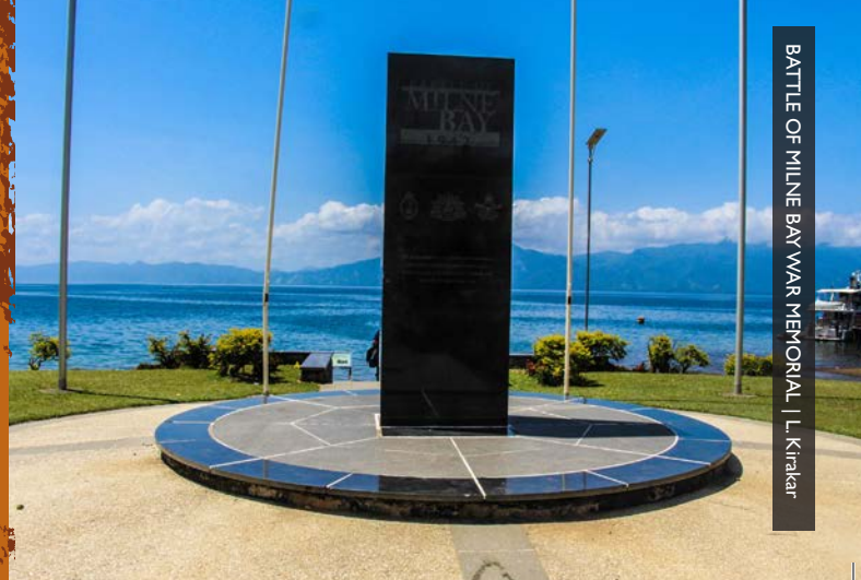
BATTLE OF MILNE BAY WAR MEMORIAL | L. Kirkland