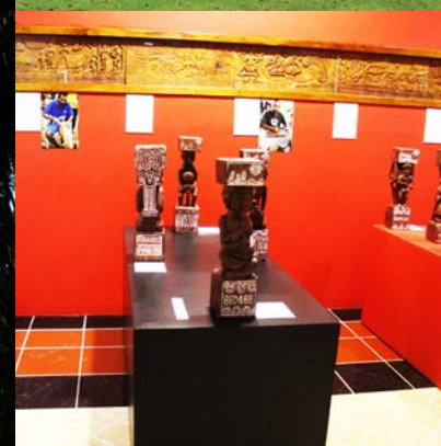
HASSIM MUSEUM, MILNE BAY