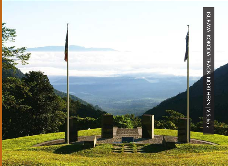
ISURAVA, KOKODA TRACK, NORTHERN PROVINCE