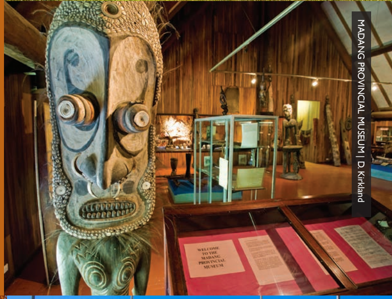
MADANG PROVINCIAL MUSEUM | D. Kirkland