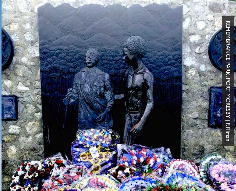
REMEMBRANCE PARK, PORT MORESBY