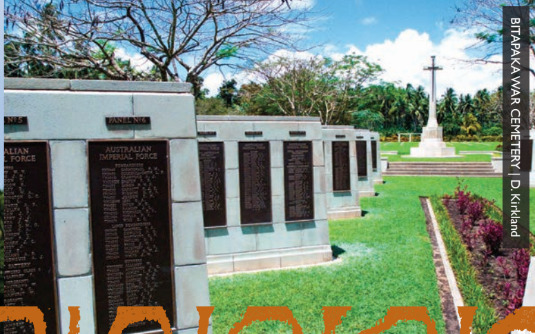
BITAPAKA WAR CEMETERY | D. Kirkland