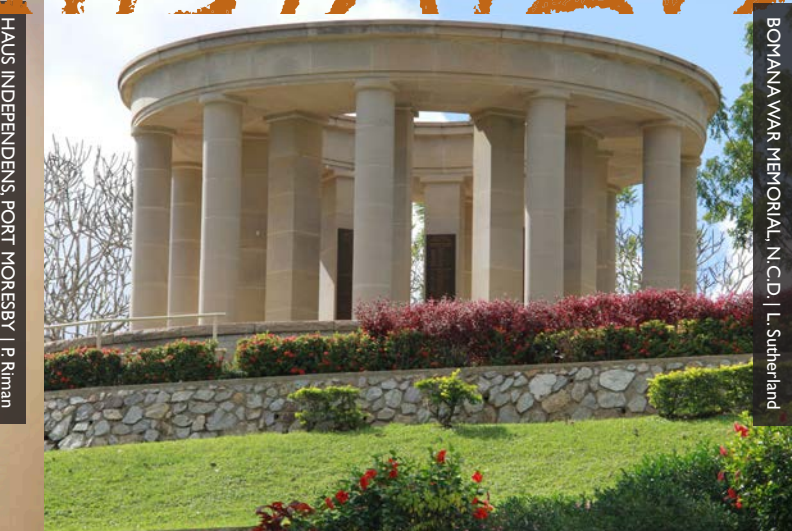
BOMANA WAR MEMORIAL, NCD