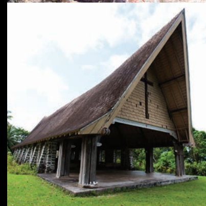
KWATO ISLAND MILNE BAY | D. Kirkland