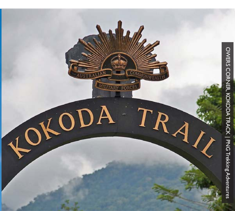
OWERS CORNER, KOKODA TRACK | PNG Trekking Adventures