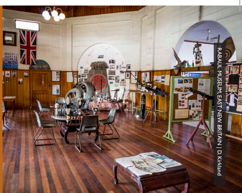
RABAU MUSEUM, EAST NEW BRITAIN

We recommend you go to the Immigration and Citizenship Authority website for more information: www.ica.gov.pg