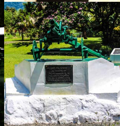
TURNBULL MEMORIAL, MILNE BAY