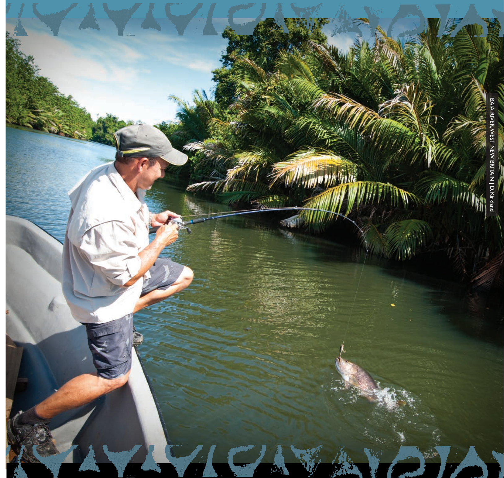
BAIA RIVER, WEST NEW BRITAIN

We have Visitor and Tourist visas available. We recommend you visit the Immigration and Citizenship Authority website for more information: www.ica.gov.pg