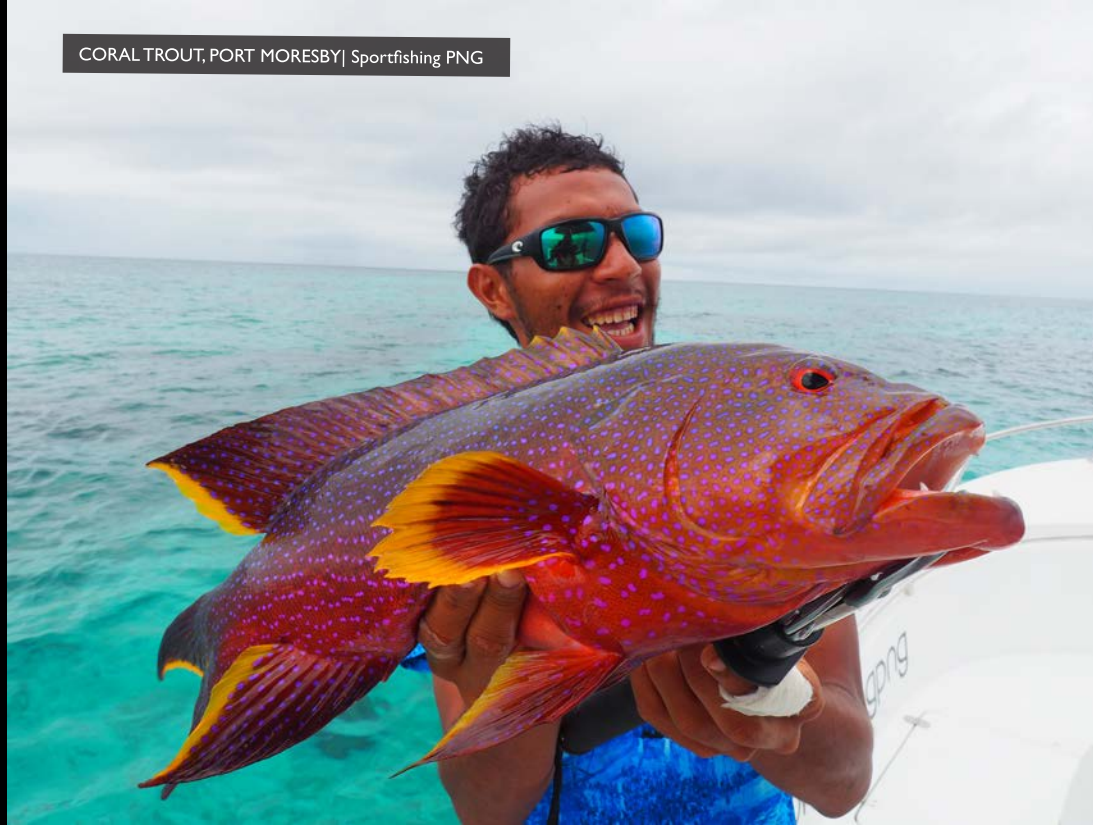
CORAL TROUT, PORT MORESBY | Sportfishing PNG