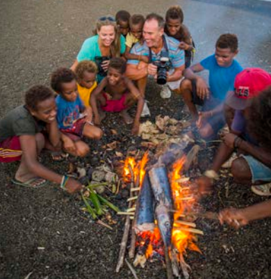
MATUPIT, EAST NEW BRITAIN | D. Kirkland