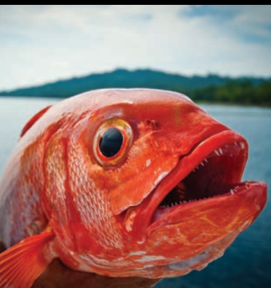
WEST NEW BRITAIN | D. Kirkland