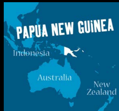
MY K20 SPORTFISHING PNG, SOUTHERN REGION