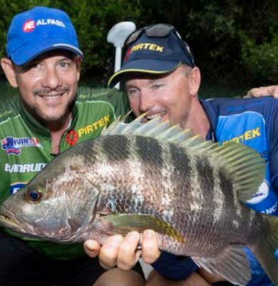
BAIA RIVER, BASS, WEST NEW BRITAIN