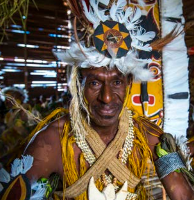
GOGODOLA, WESTERN | D. Kirkland