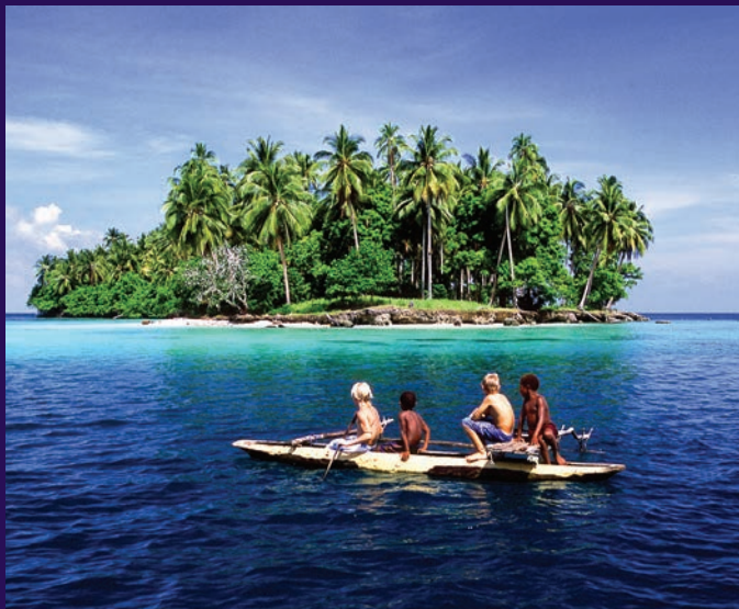
JACABEN, MADANG

WELCOME TO PAPUA NEW GUINEA CRUISE FOR A HUNDRED DIFFERENT JOURNEYS.