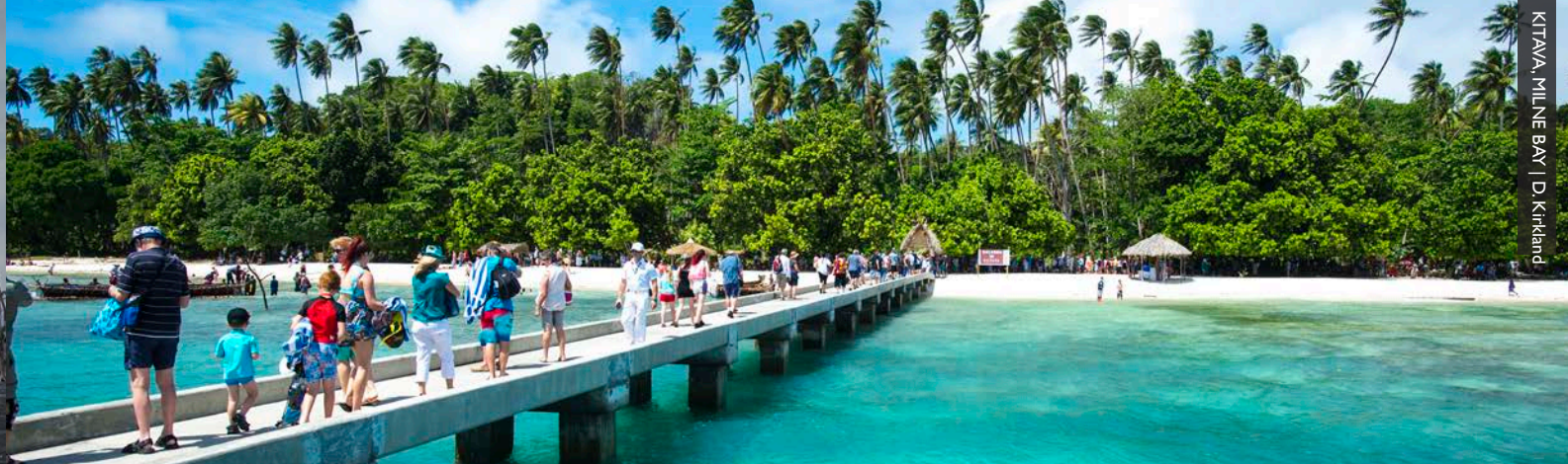
KITAWA, MILNE BAY | D. Kirkland