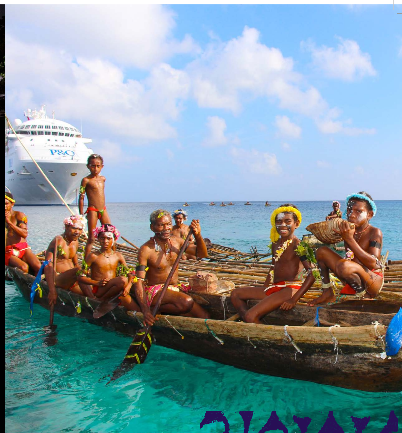
NORTHERN (ORO) PROVINCE | M. Trosle

Papua New Guinea A MILLION DIFFERENT JOURNEYS Tourism Promotion Authority