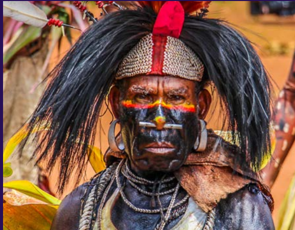
KUTUBU KUNDU & DICASO FESTIVAL | H. Luvani

Overland tours can be arranged with local tour operators to the Highlands and other regions of the country then back in time to continue your Papua New Guinea cruise journey.