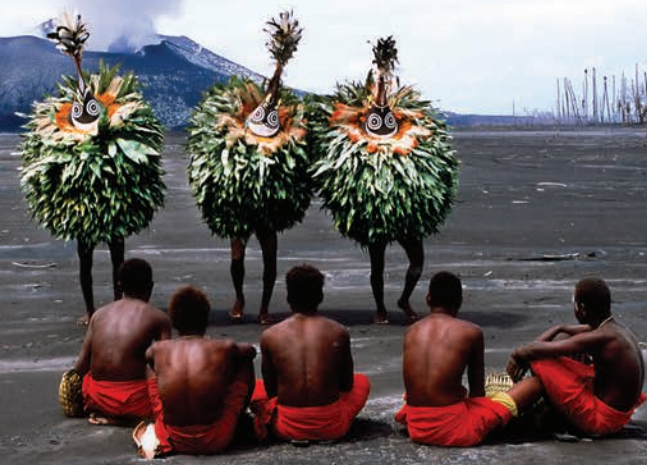
COVER: TROBIAND ISLANDS, MILNE BAY | D. Kirkland